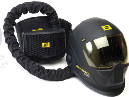
SENTINEL A50 Air with ESAB PAPR unit